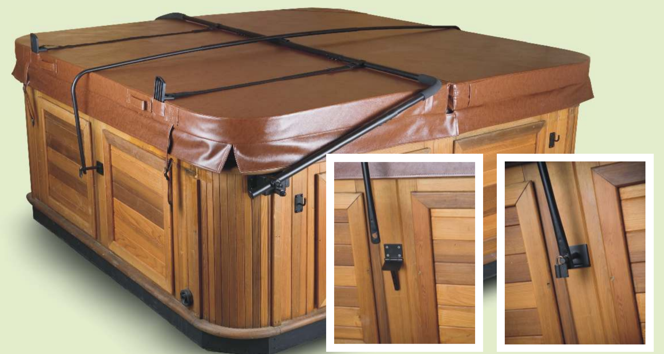
Universal Cover Lock