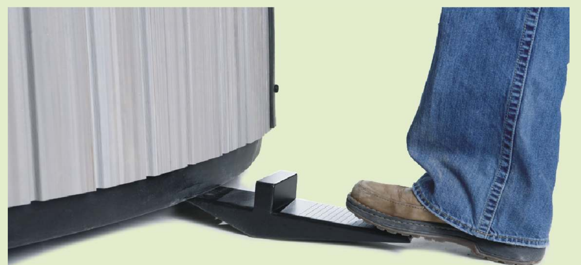
Universal Spa Wedge