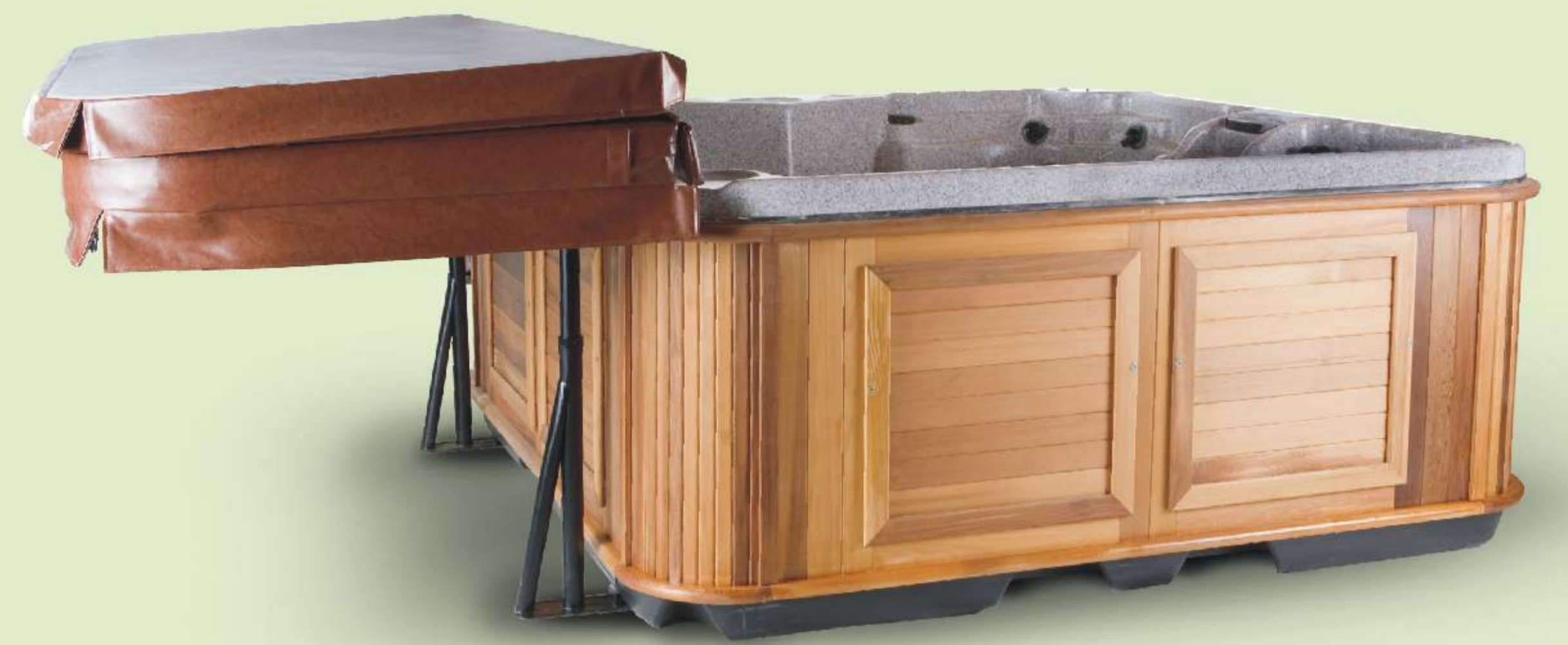
Cabinet Free Cover Shelf