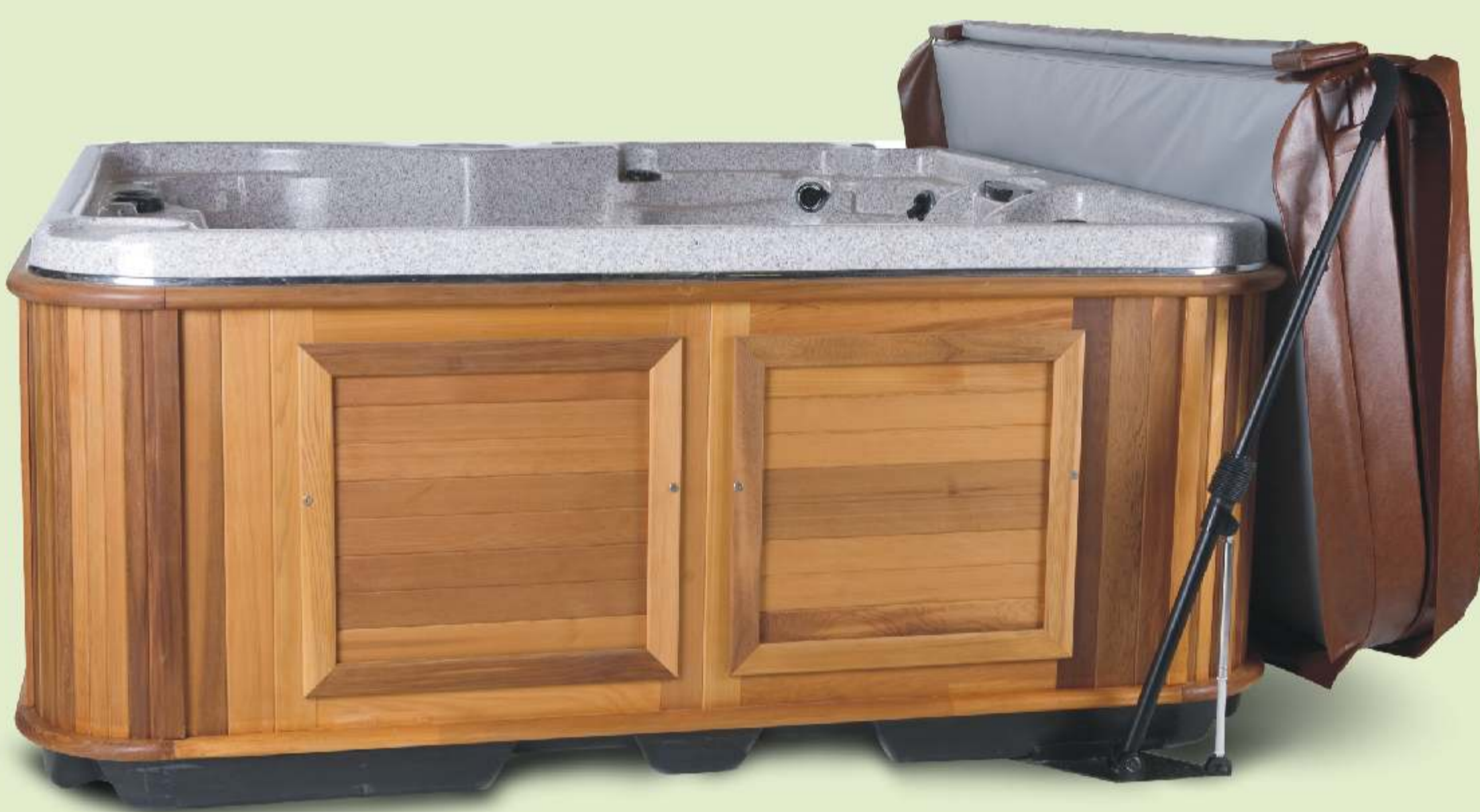
Cabinet Free Universal Assist Lifter