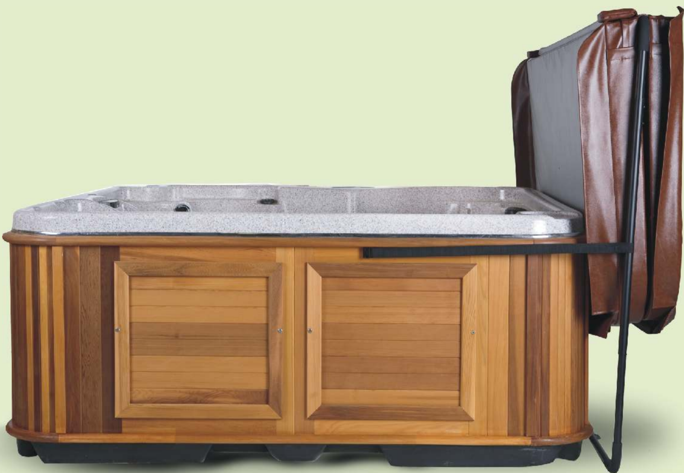
Cabinet Free Cover Rest